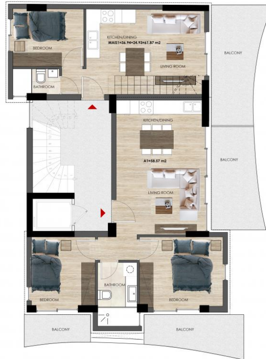
LIDORIKIOU Str FIRST FLOOR